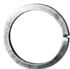
R 1317/1 \square 12×12 mm 115 mm 340 Ft