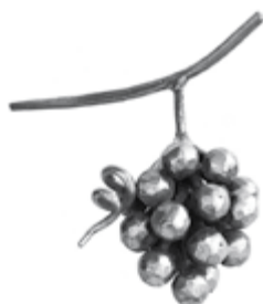
R 673/2 90×70 mm 11670 Ft