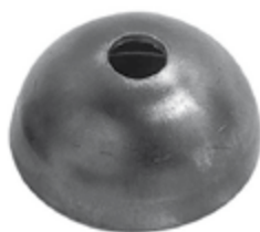
üreges gömb furattal